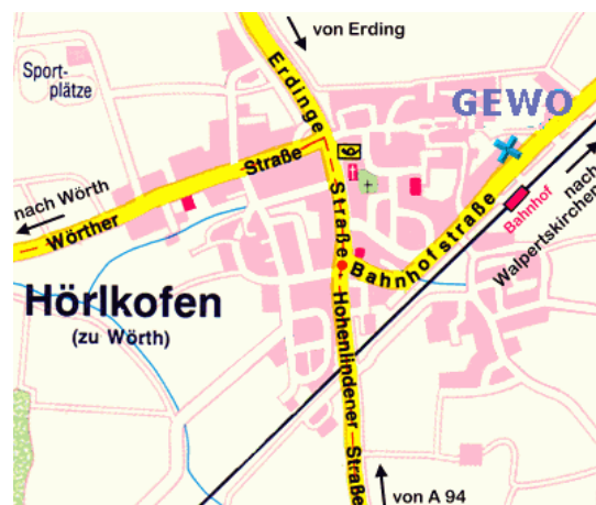
Map of Hörlkofen

GEWO Feinmechanik, Bahnhofstraße 23, 85457 Würth/ Hörlkofen Tel.: 08122 / 9748 0