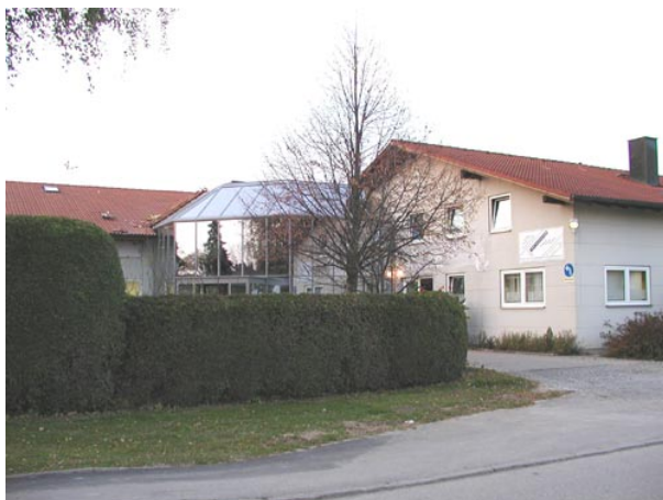
That's GEWO – (visitor's parking area)